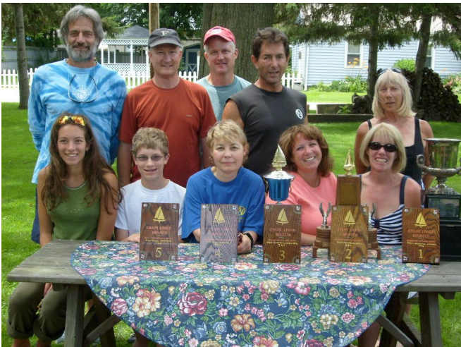
Top 5 Finishers at the 2008 Great Lakes Regatta