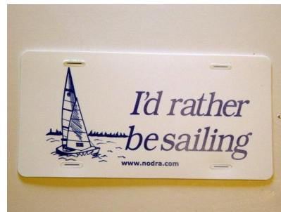
$5.00 USD, proceeds to NODRA

2008 NODRA DUES ARE DUE !!! NODRA Dues are payable April 1 st of each year, and entitle members to full rights and privileges thru March 31 of the next calendar year. HELP N.O.D.R.A. G-R-O-W and become a member in “Good Standing” today. Membership Forms are available at the JOIN! page of www.nodra.com .