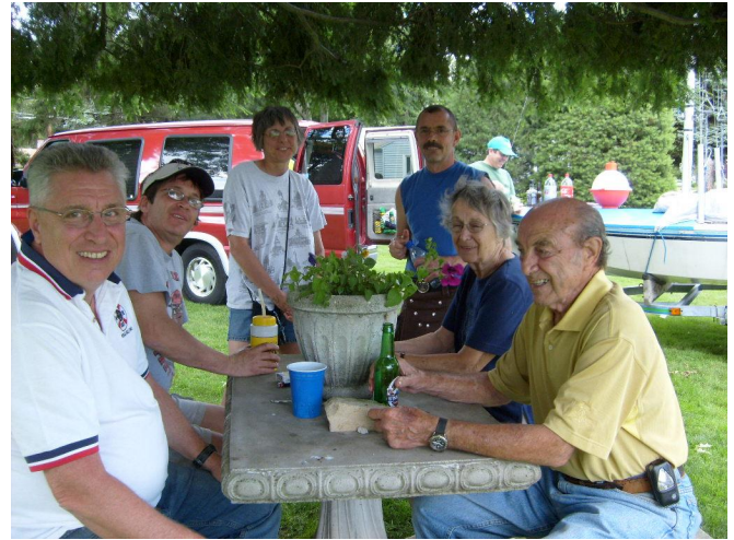
Attendees at the Great Lakes Debriefing the “windy” but fun-filled event: